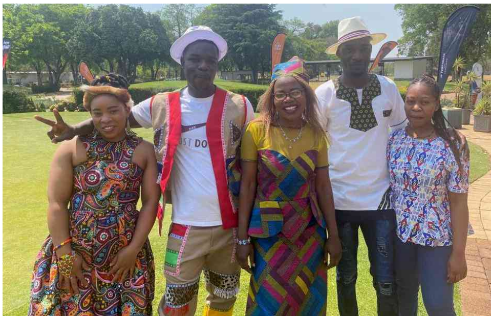
Celebrating our heritage...