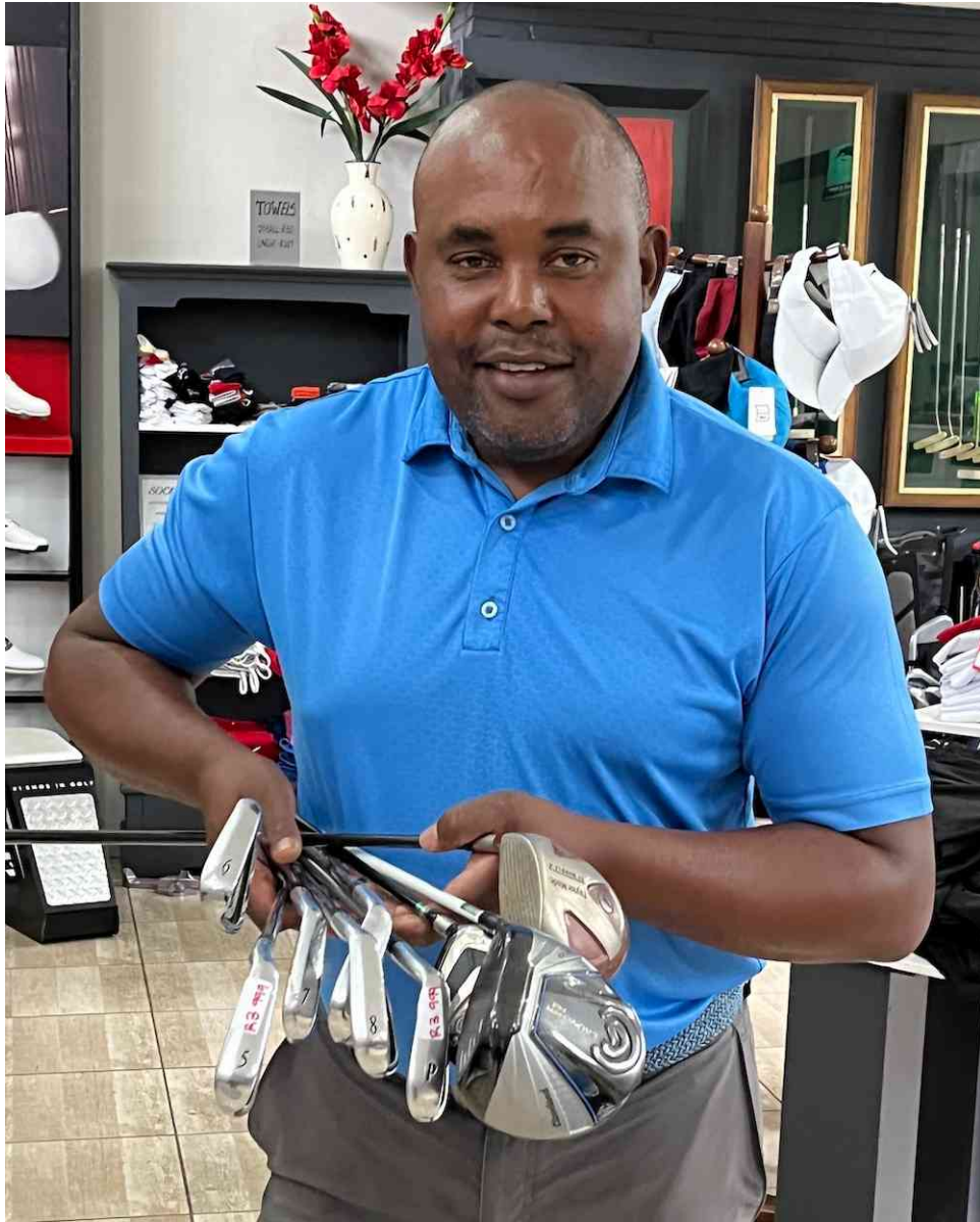
Win with our Par 3 Challenge