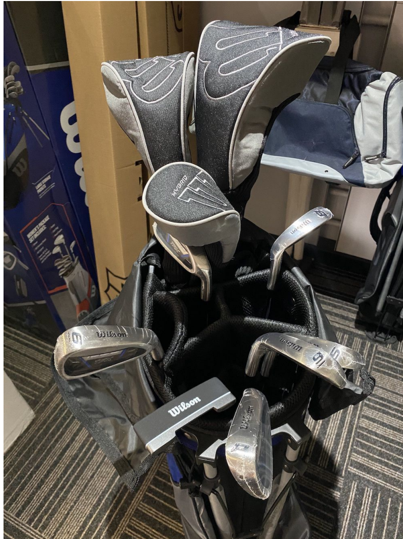
Wilson D7 Driver, 3 Wood, Hybrid & Irons – R 14 999