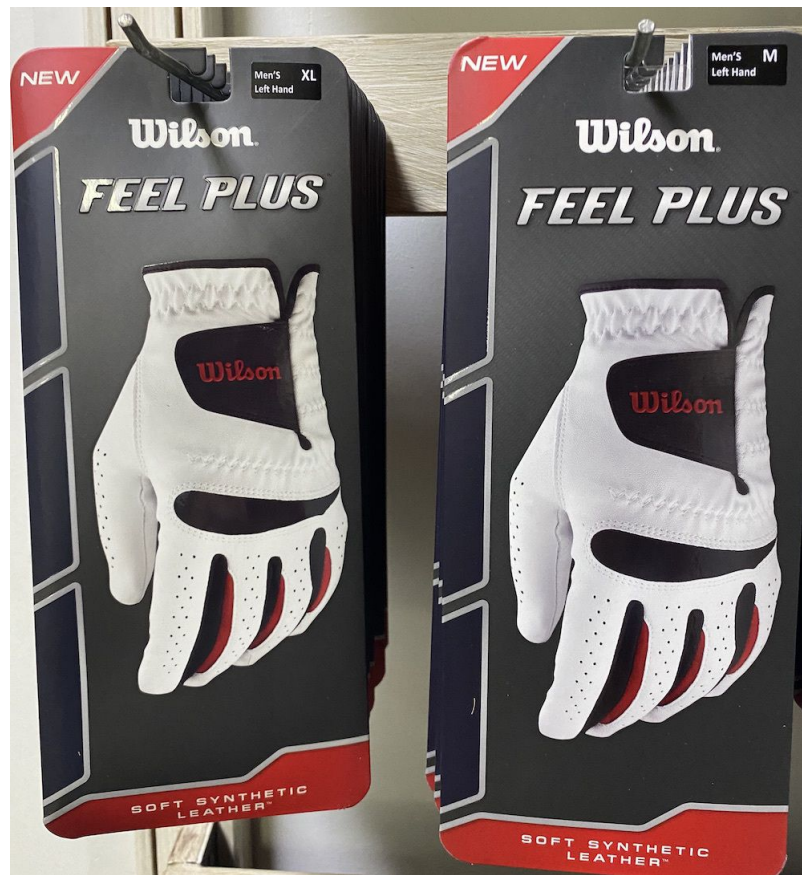
Junior Gloves – R129