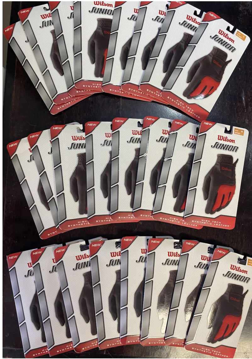
Wilson Full Starter Box Set – R 5 999