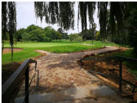
The new path at the 7th hole has been completed.